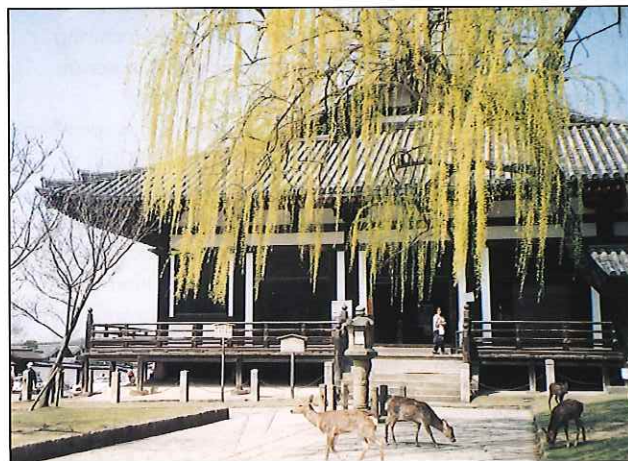
Temple at Nara, with sacred deer

All delegates must pre-register with the T.I.C. by September 6th.